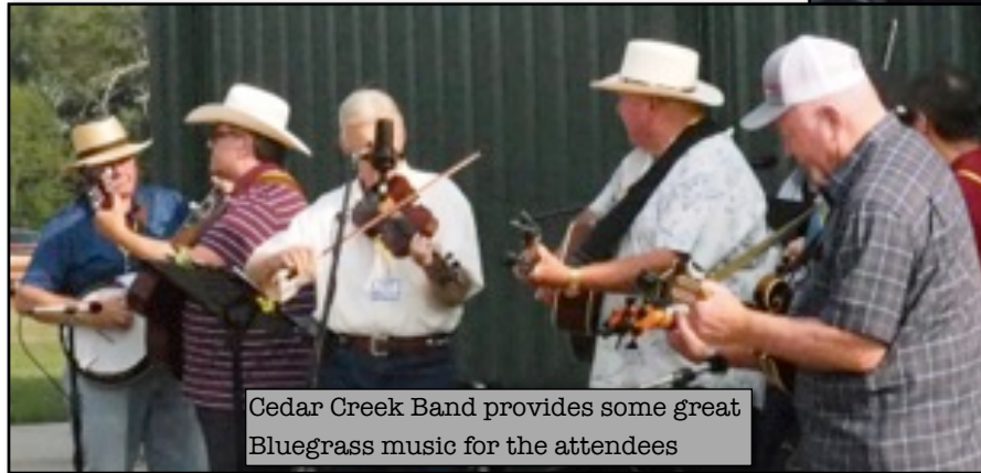
Cedar Creek Band provides some great Bluegrass music for the attendees