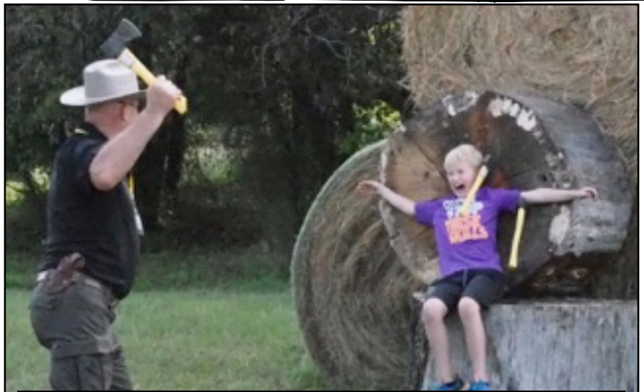
Keeping Grandkids in Line We finally decided painting a target circle was easier