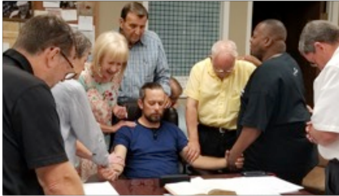
"come to the table"