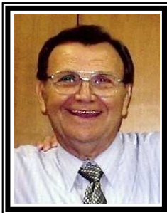
From the Desk of the President of PPM

MISSION STATEMENT: Perkins Partnership Ministries (PPM) has been formed as a non-profit organization to practice and proclaim the life-changing message of the Lord Jesus Christ in the world's most spiritually receptive places.