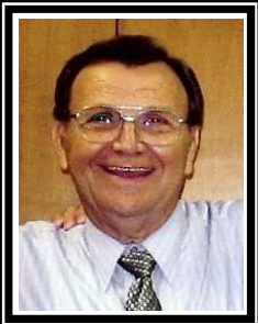
From the Desk of the President of PPM

MISSION STATEMENT: Perkins Partnership Ministries (PPM) has been formed as a non-profit organization to practice and proclaim the life-changing message of the Lord Jesus Christ in the world's most spiritually receptive places.