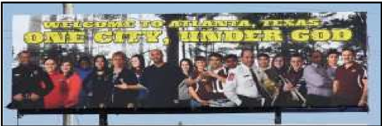
(Billboard on Hwy 59- downtown Atlanta)

YOU Helped Make This Possible! Through YOUR support and God's anointing, Atlanta, Texas will never be the same!!